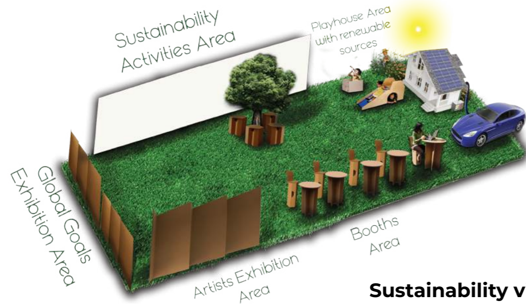
Sustainability village © & Floating Boat Laboratory by The Energy Observer

The sustainability village will also have the collaboration of Energy Observer Floating Laboratory boat which will feature dome exhibitions for Global Cynergies sustainable initiatives.